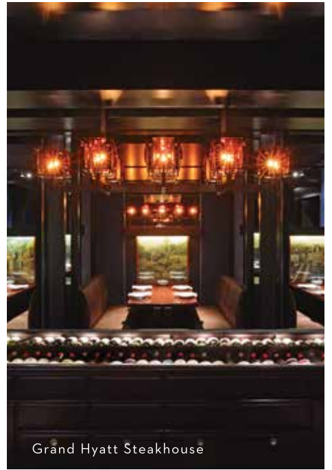
Grand Hyatt Steakhouse