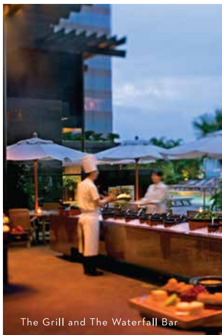
The Grill and The Waterfall Bar