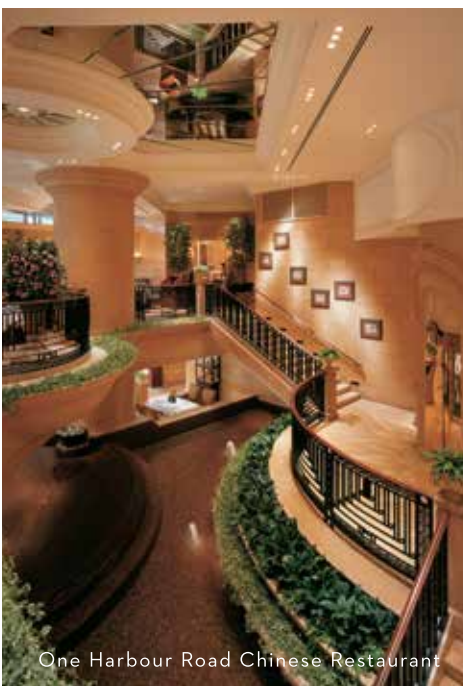
One Harbour Road Chinese Restaurant