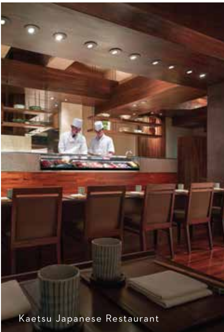
Kaetsu Japanese Restaurant