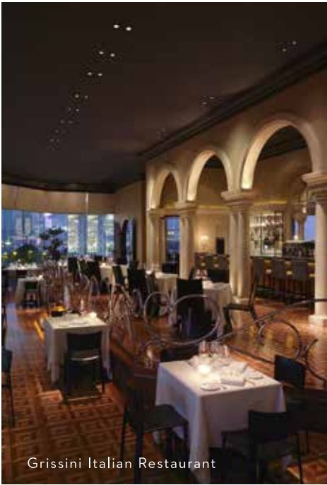
Grissini Italian Restaurant